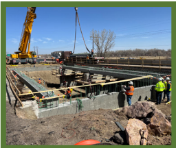
Military Access, Mobility & Safety Improvement Project (CM/GC) CDOT Reg 2, Colorado Springs/Fountain, CO