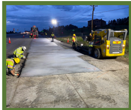
CO 83 Parker Road CDOT Reg 1, Parker, CO