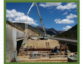
F-13-S Minor Structure Design (CM/GC) CDOT Reg 3, Summit Co., CO