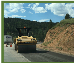
CO 67 Resurfacing CDOT Reg 1, Reg 2, Wemore/Florence, CO