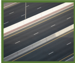
I-25 Concrete Rehabilitation CDOT Reg 1, Castle Rock/Lone Tree, CO