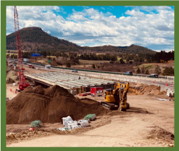
I-25 South Gap: Monument to Castle Rock (CM/GC) CDOT Reg 1, CO