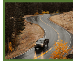
CO 149 Reconstruction (Creede to Lake City) CDOT Reg 3 & 5, CO