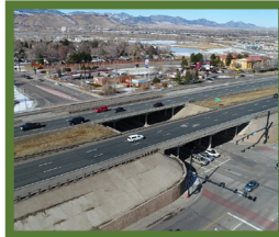
I-70 over 32nd Bridge Replacement CDOT Reg 1, Wheat Ridge, CO