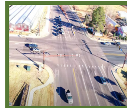
W. 72nd Avenue: Kipling Street to Simms Street City of Arvada, CO